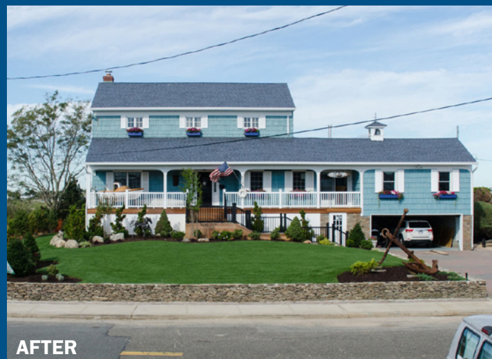
Project example House Elevation – Freeport, New York