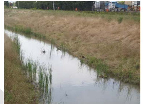
Figure 2-4: Skokie River Stream Daylighting Project, Two-Stage Channel