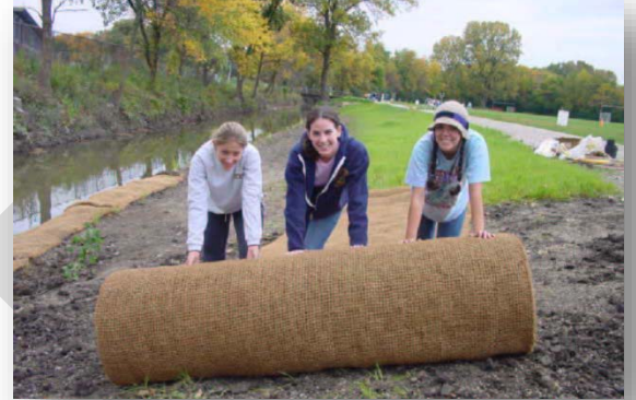
Figure 2-6: Students volunteer to help implement a streambank stabilization project adjacent to Deerfield High School