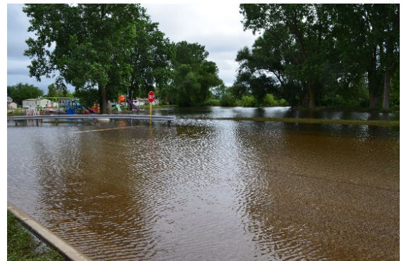
Figure 2-3: City of Park City July 2017 roadway flooding along the Dady Slough