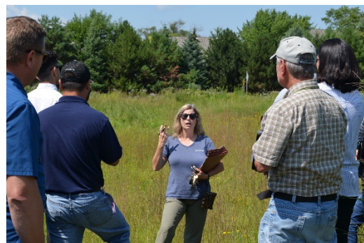
Figure 2-5: The Village of Glenview led a BMP public tour at NBWW's 2018 Annual Meeting