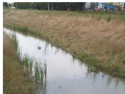
Figure 2-4: Skokie River Stream Daylighting Project, Two-Stage Channel