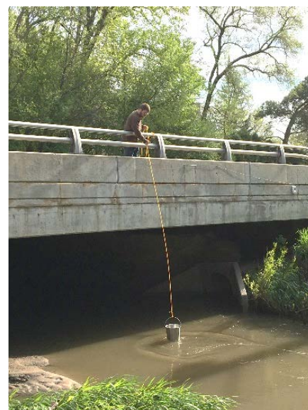
Figure 2-2: NBWW water column chemistry sampling