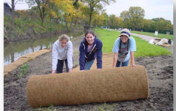
Figure 2-6: Students volunteer to help implement a streambank stabilization project adjacent to Deerfield High School

Indicator: Number of participants during the annual Chicago River Day event.