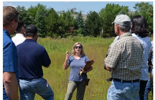
Figure 2-5: The Village of Glenview led a BMP public tour at NBWW's 2018 Annual Meeting