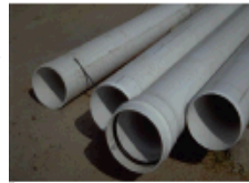
Waste exits the house through a sewer pipe and enters the septic tank. There, solids settle out and grease and scum float to the top.

When a septic system fails to the ground surface or backs into a dwelling, the flow of wastewater into the system must be controlled. Most likely, wastewater held in the septic tank must be pumped and hauled away by a licensed septage pumper. Emptying the septic tank will eliminate ongoing failure, and will provide some storage capacity for sewage to accumulate through usage without contributing to further discharge or backup. The available storage volume (and available time before sewage again discharges) depends upon the size of the septic tank and the usage. Since hauling wastewater is inefficient and expensive, reduce water use as much as possible, and begin activities to evaluate and repair the system right away . Continuous pumping/hauling of sewage, as often as the septic tanks fills, will likely be necessary to avoid additional failure incidents. If under a Notice of Violation , each observation of sewage improperly discharging may increase penalties, and an owner's failure to interrupt the improper discharge after notification will suggest to the Department that moving forward with enforcement, eventually referring to the States Attorney, is required.